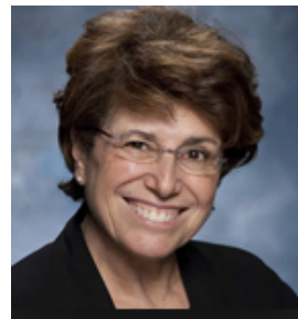
Cheryl Dreyfus Chair of Neuroscience